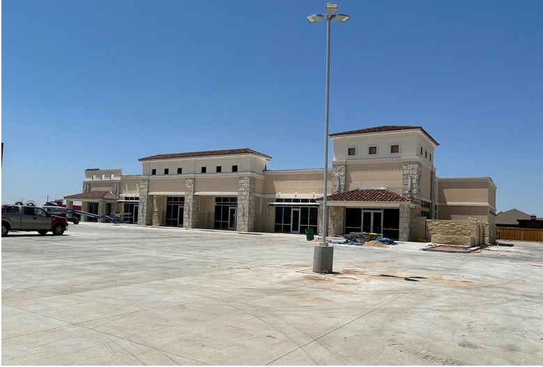
128TH Street Shopping Center UNDER CONSTRUCTION